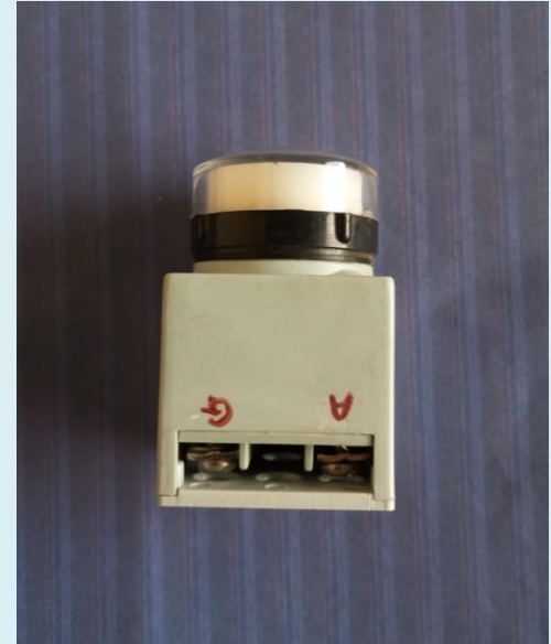
DUAL TO FIVE COLOR